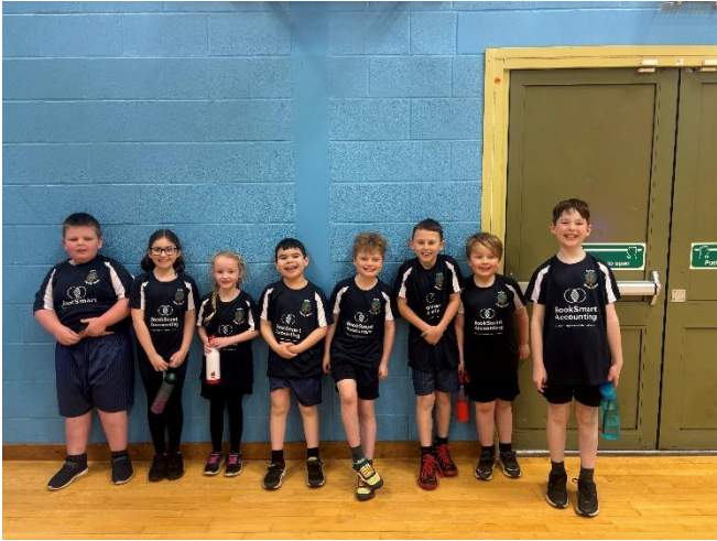
The team enjoyed their dodgeball event last night, playing 5 games. Well done!