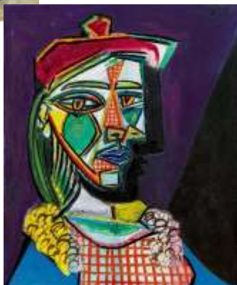
Timeline of artists/movements: